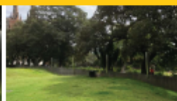
Looking north, towards the existing concrete well and the cathedral