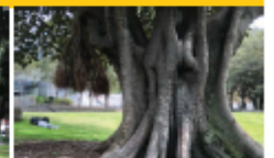
Looking at the base of the existing fig tree