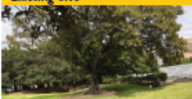
Looking west, towards the existing large fig and swimming pool