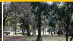
Standing beneath the existing tree canopy, looking down towards Yurong Parkway