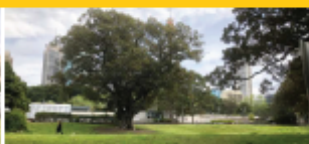
Looking west, towards the existing large fig, swimming pool and city skyline